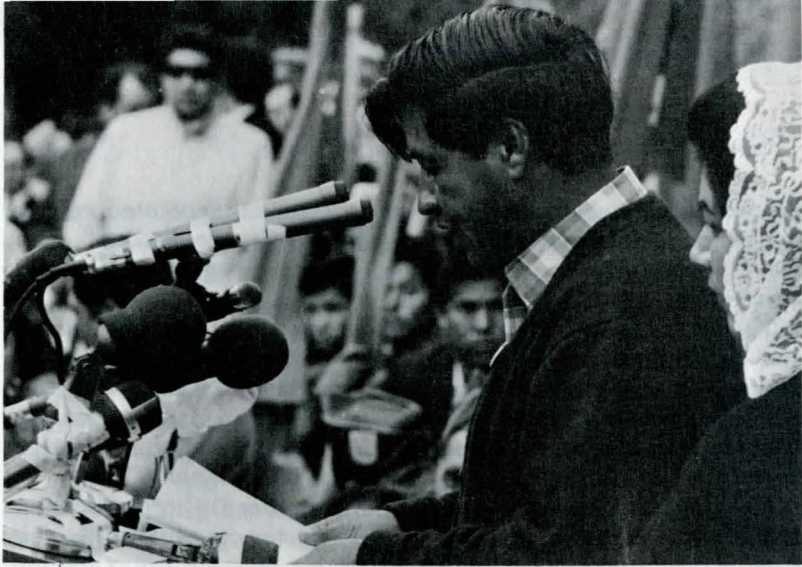
Cesar Chavez speaks at State Capitol, Sacramento