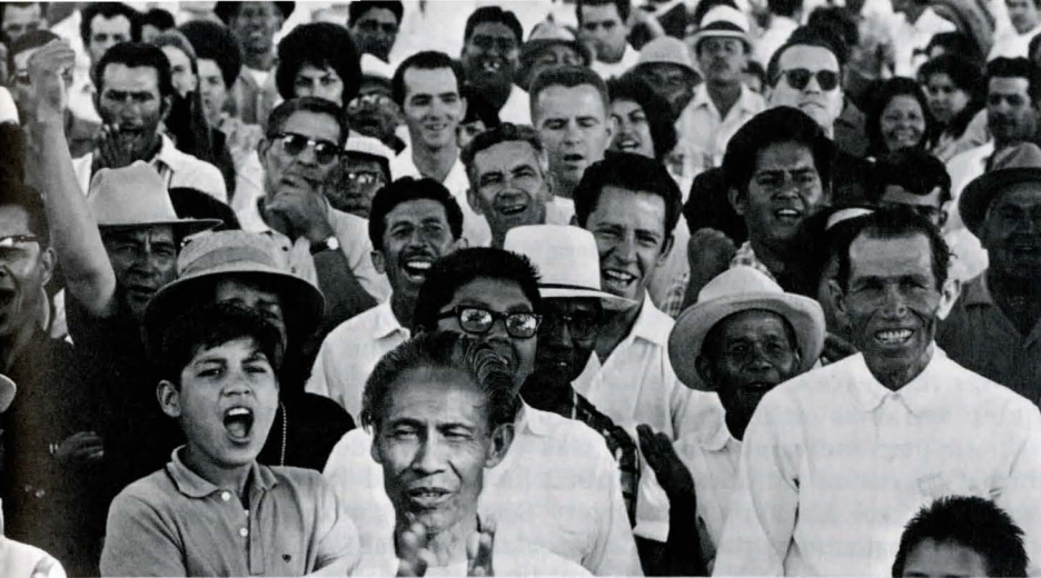
Striking grape workers