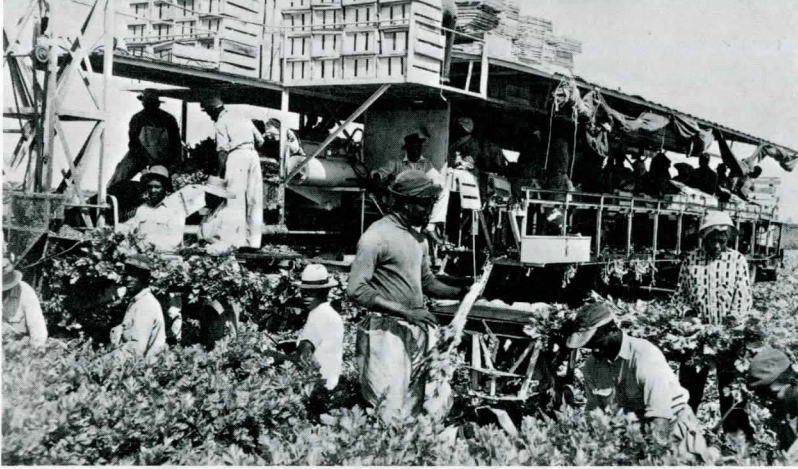
A factory in the field