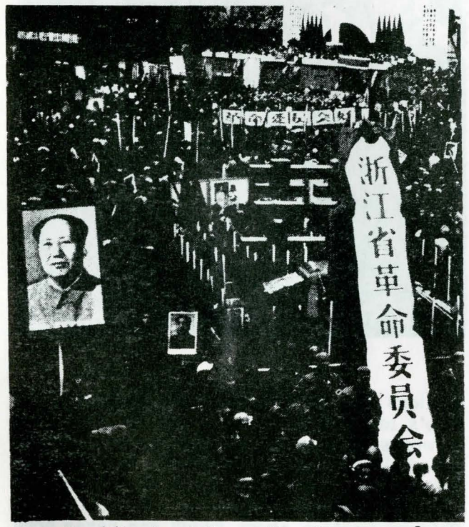
Hangchow City-Revolutionary Committee Seizes Power

Today's accusations resemble, in a new period and a new context, the old arguments against land reform in China advanced by