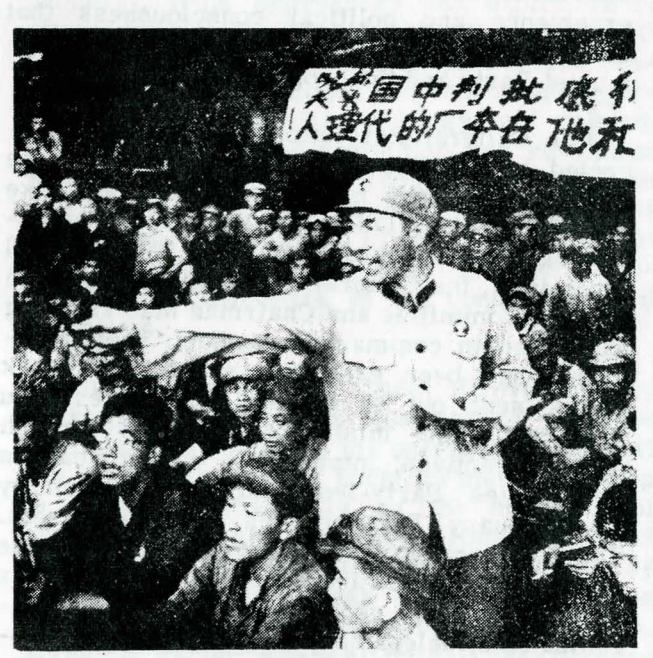
"Bombard the Headquarters!"

was by vastly superior forces, if the Common nist Party had not served the people, it wants have been deserted by them and crushed, Later, when the Party held power over vast areas it became necessary to supplement this built-in regulator by organized movements such as the "gate" of 1948, where peasants sat in judgment on cadres. The same basic method was used in the movement against graft, corruption and bureacracy, the famous "San Fan" of 1952, in the Socialist Education Movement of 1963 and now, on a much wider scale, in the Cultural Revolution. Far from destroying the Communist Party, such movements have vastly strengthened it. They have exposed weaknesses, corrected mistaken cadres, raised the political consciousness of cadres and people alike, weeded out hopelessly corrupt individuals and, of course, counter-revolutionaries. Each of these move-