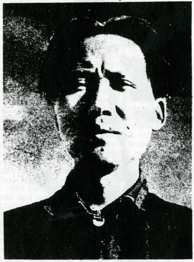
Mao Tse-tung, Pao An 1936

Viewed in the context of this history the Cultural Revolution takes its place as the latest