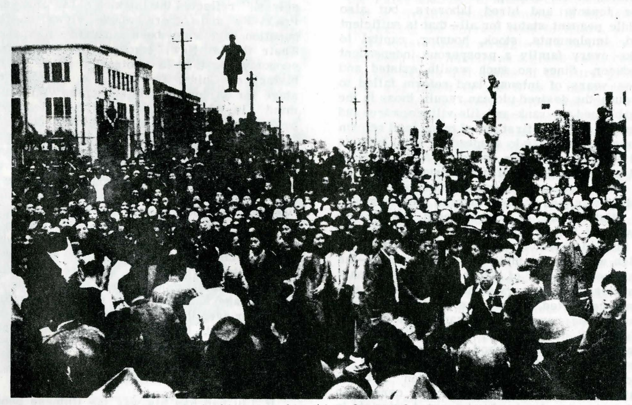
Celebrating the liberation of Nanking, Sun Yat-Sen Square 1949

the alienation of large numbers of middle peasants. In "Fanshen" this tendency is described as coming primarily from below, from the native equalitarianism of petty producers who, once they began to seize land, did not make any clear distinction between landlords, rich peasants and middle peasants, nor between the essentially capitalist (i.e., industrial and