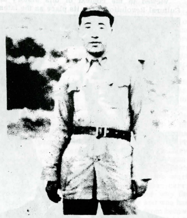
Lin Piao in 1936

rural civilization, began as soon as these two classes were formed in the late 19th century. Imperialist intervention brought these classes into being and imperialism, in alliance with China's landed gentry strove to keep them down and use them to the advantage of the West. Suffering from the same oppressors, workers and capitalists often fought together for an independent, modern China, but since they formed the opposite poles of a fundamental class contradiction and since their ultimate